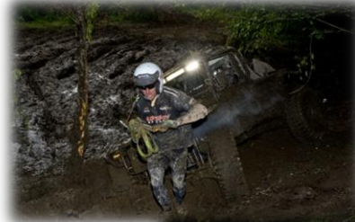
Clawing mud and steep slopes

We started fifth and finished first, winning the stage by 7 minutes. Time for some well earned sleep, finally we get to bed at 4am after servicing the car for the following day.