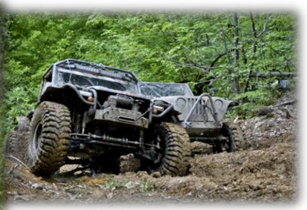
Overtaking Croatian style