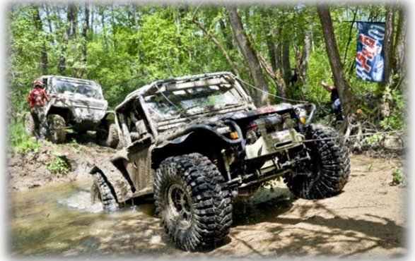
Even the top teams can be winching up to 20 times a day!

It's the night before the final day. The weather is amazing and the sunset stunning and from around camp comes the sound of welders, generators and grinders as teams work hard to be ready for the final push. We are expecting a 35/40km stage; the whole team is feeling the nerves. We have a strong lead but this the Croatia trophy and anything can happen, the car is prepped, the team is ready. Bring it on!