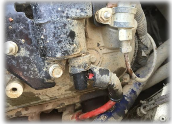
Damage from branches is always a hazard

Then trouble struck when dried leaves blocked the radiator causing us to over heat, with our temperature gauge misleading us as it faulted. Thankfully as friends passed they gave us water to continue. We received help from Russians, Hungarians, Germans and Austrians. How cool is that! It's great to race with such friendly teams. But the mistakes and over heating cost us a huge chunk of our lead!