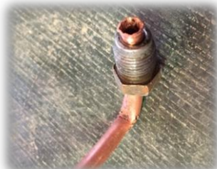
Super fix! brake pipe repaired on the trail