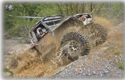
Short Trophy Day stages were great fun

After the drama of yesterday it was great to see we still had a 18minute lead. Today is Trophy day. We race 12km individually through heavy forests to a quarry leaving the start in two minute intervals. Then we are split into teams of four vehicles based on yesterday's results. We struck gold being teamed with Szilard (Hungary), Fritz (German Legend) and the Ruel brothers (Belgium). We had to complete three simple stages as a team and then race as a four vehicle team 12km through the forests. The catch being we only had one road book and one control card! We blitzed the stages and then head back into the forests. Szilard leads out and nailed the navigation, while we took up tail end Charlie sweeping behind, although following three heavily modified diesel cars is no fun. We were fastest by three minutes despite Fritz breaking his gear-lever.