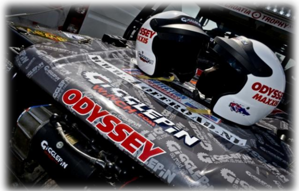
Ready for action