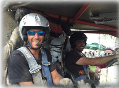
All the way from Israel and loving it!