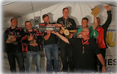
On the podium with the Russians and Hungarians