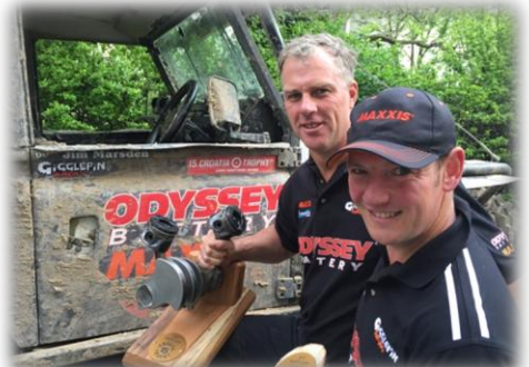
Two times Croatia trophy champions - GigglepIn Racing!