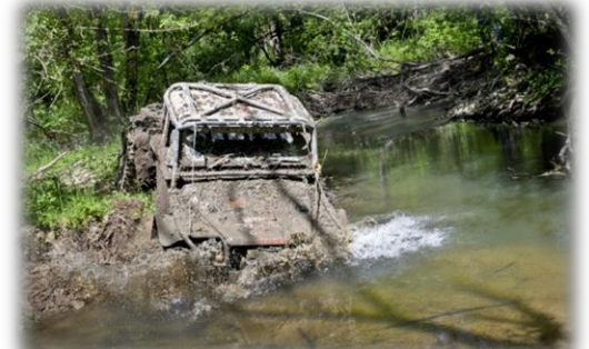
crystal waters hide deep mud