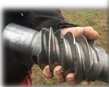
A PTO winch gear dies on another competitors car