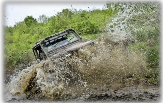
no such thing as an easy water crossing

52km kilometres of fast forest tracks with brutal water meadows and hard to find trails. We start first and have great pace until at 80mph, heading up a fast track towards a main road, the brake pedal hits the floor! Down changing I managed to get our pace down to 20mph and we cross without incident but that was a spooky moment. The problem was a main brake pipe had been bent, caught the frame and rubbed through. We managed to cut the pipe back, fashion a new flare using a hammer and punch and get back on the road. But by this time we had dropped several places. We soon passed the lead cars but small navigation errors plagued us the rest of the day and we finished 3rd losing a few minutes of our precious lead.