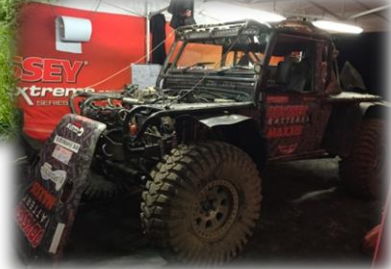
Late night servicing