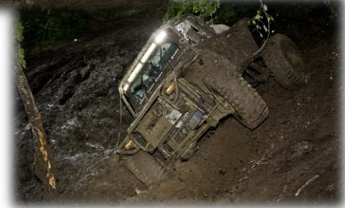
The new Lazer lights are amazing!