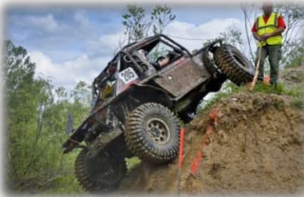
Just love technical driving