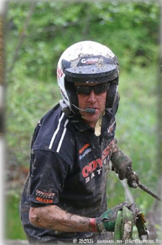
The big guy doing his stuff