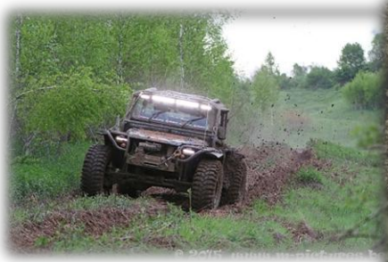
Laying down the power

Wayne was on top form and our navigation was superb until only 3km from home the track just disappeared..... We spent 45/60 minutes searching and finally found our way. Many teams struggled with the tough conditions and we have been lucky to win the stage and extend our lead to over 2 hours! Two more days of rock hard forest driving still to over come. It's not a time to take chances and we undertake a major vehicle service that goes on well into the night with a few jobs left to complete in the morning before the start.