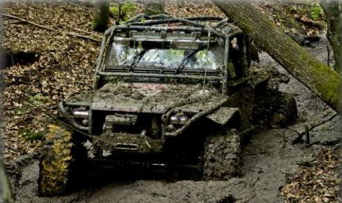
Back to the forests