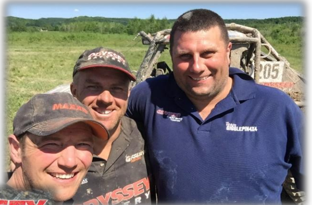
The winning team