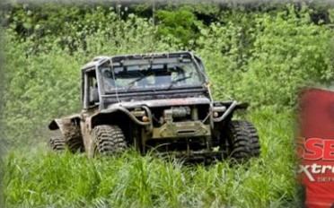
Blazing across the water meadows