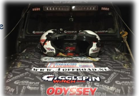
Ready for the night stage

Then we are off! Fast and slippery forest sections with huge water meadows and steep winch climbs. I love these night sections and thrive on the danger and the speed. This year we are using Lazer Lamps new Triple R Elites and simply wow!!! Game changers! But what i won't be doing again is wearing glasses with yellow lens. They went out of the window around 5km!