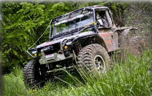
The water meadows are deep and seriously wet