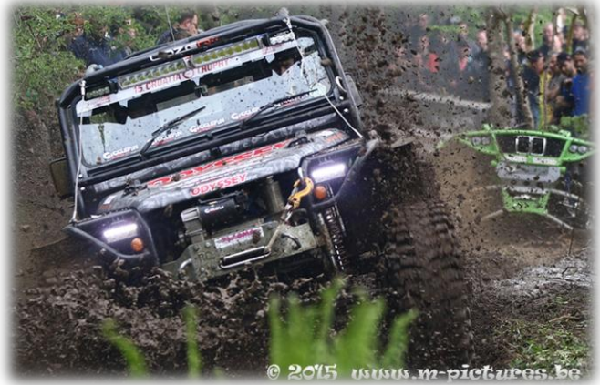
The prologue went to plan

The weather is stunning and the cars head into Topusko for lunch, a show start and to meet the fans before heading to the forests for the prologue. It's a fast stage with four cars in each group; we don't want to win this and are over the moon to be placed 10 th . It's the perfect position to launch our attack!