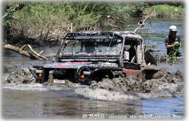
Bringing it home

A quick alternator change and a jump start from a kindly competitor and we are back in the game! We have lost 15 minutes and instinct takes over as I increase the pace to compensate. I am staggered at the generosity of the drivers ahead as they pull to the side without hesitation as they hear us approach. All too soon the stage is coming to an end with the climax being a huge double river crossing. We dive into the crystal waters and power across the first run, then it's a dash along the bank, a near vertical drop into the river and 100m crossing to the finish. We dive in and the car sinks fast with water over the bonnet. The river is very wide so we winch back to shallower waters before Wayne charges across to set the front winch. It's text book stuff in front of large crowds. As I pass the winch point I change direction for the finish line and Wayne nails it securing the winch so I don't have to slow or falter. We power across the line and we are Croatia Trophy 2015 Champions! What a feeling! What a buzz! What a week! What a Team!