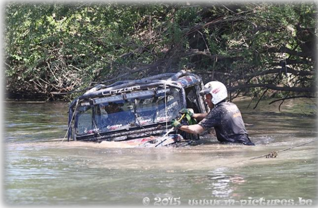
The last water crossing was seriously deep