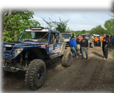
Into the forests

The first few kilometres went really well and we soon passed three or four cars. Then at check point one it went to hell. The road book didn't fit the terrain and we lost over 30 minutes trying to find the way. Eventually we got back on track and set off hunting the cars that had passed us. We had some great racing with the Hungarian and Russian drivers with the water meadows being as deep, wet and nasty as ever. We smashed it, finishing first with a massive 1 hour lead. Only 6 days to go!